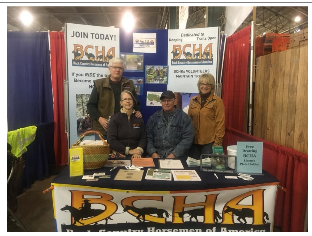
MN Horse Expo Booth 2018

This was the 1st year we had a booth at the Minnesota Horse Expo. We were located in the cattle barn at L833.